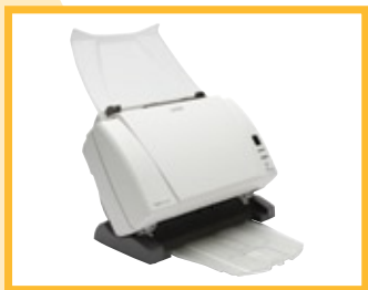
Kodak i1200 Series Scanners

Smart Touch functionality is built into all of these Kodak Scanners—